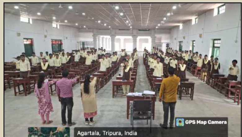
Agartala, Tripura, India