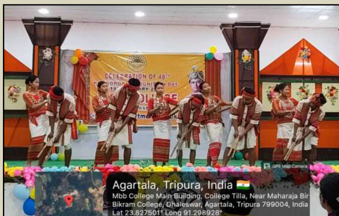
Agartala, Tripura, India Mbb College Main Building, College Tilla, Near Maharaja Bir Bikram College, Dhaleswar, Agartala, Tripura 799004, India Lat 23.827501° Long 91.298928°

The cultural segment featured Kokborok songs, traditional and contemporary dances, poetry recitation, and competitions such as speech and quiz.